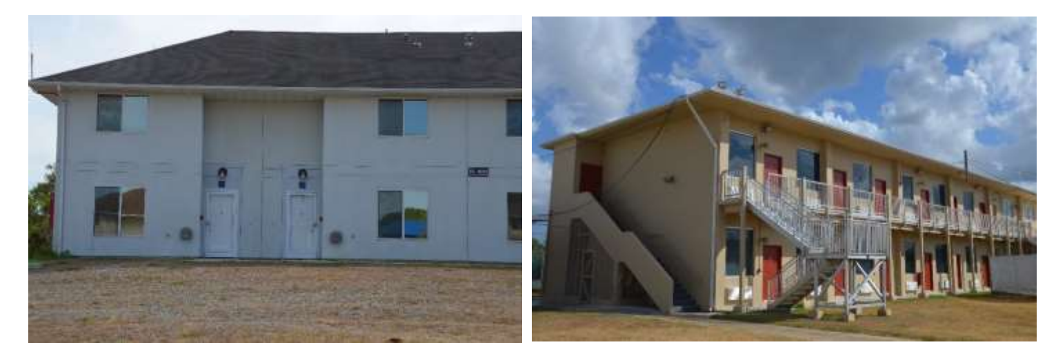
[East Caravella: E4-E5]

E-4 and below Technicians that are required to stand duty and do not have a personal vehicle will be assigned berthing in H5 on the hospital campus grounds to alleviate any possible duty conflicts caused by transportation.