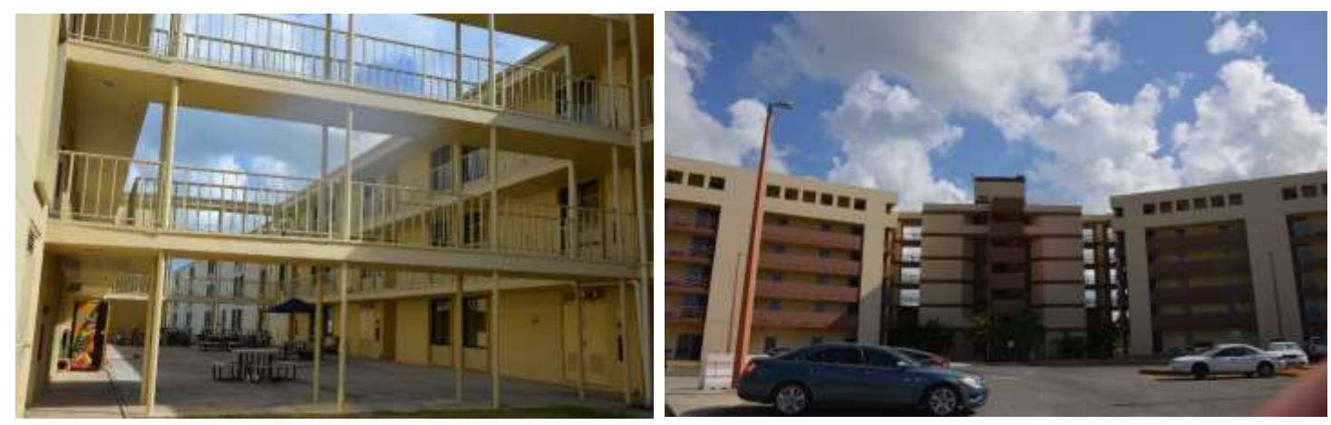
[Marine Hill: E4 and below]