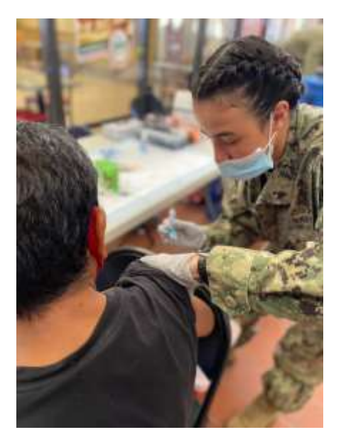
Directorate Nursing Services (Multi Service Ward, Home Health, Patient Safety)