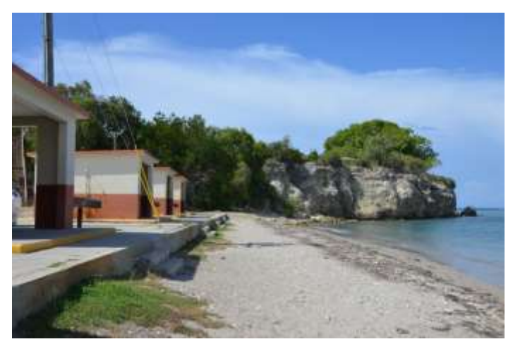
Ferry Landing Beach